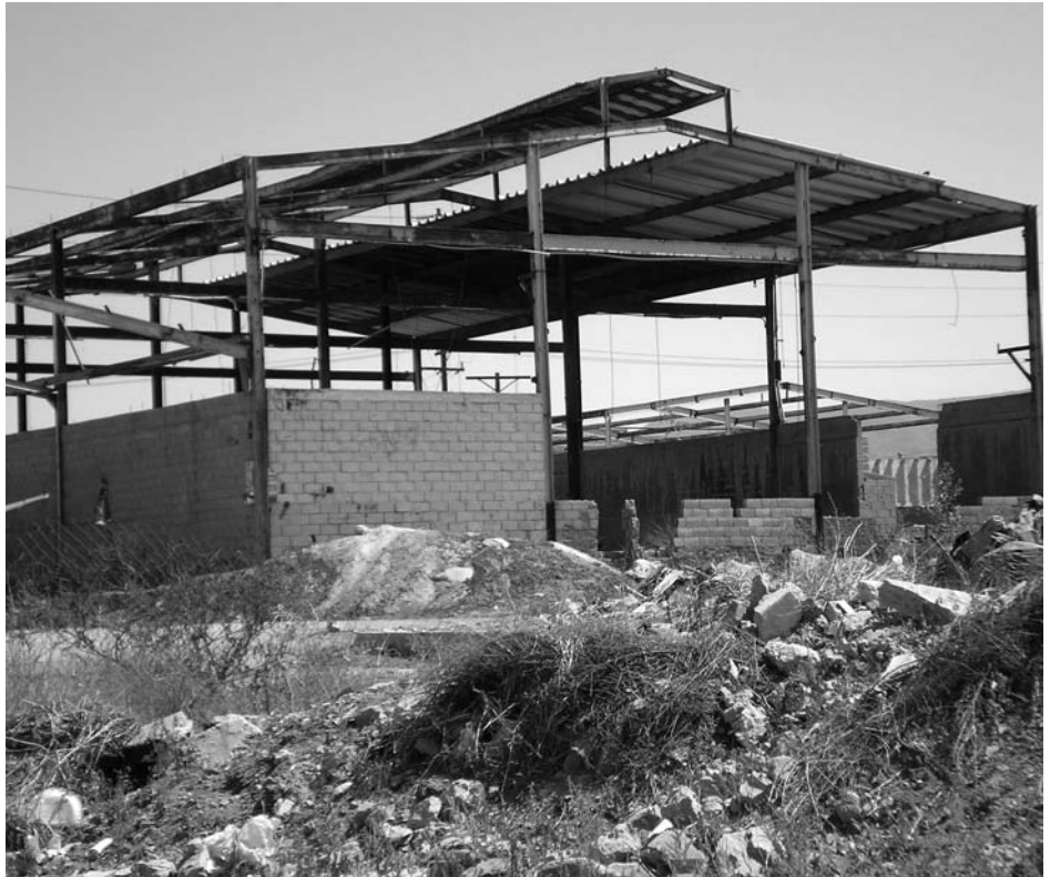
When it rains, hazardous waste from this abandoned battery recycling facility is washed downhill into the school and streets of the nearby worker settlement.

The trip included a visit to Metales y Derivados , an abandoned maquiladora that is infamous for the almost 24,000 tons of mixed hazardous waste (including 7,000 metric tons of lead slag, traces of sulfuric acid residue, and heavy metals such as cadmium and phosphorus) that were left behind when a San Diego-based battery recycling operation abandoned the site in 1994. The nearby Río Alamar is heavily contaminated with run-off from the toxic site and with other biological and industrial waste. The neighboring